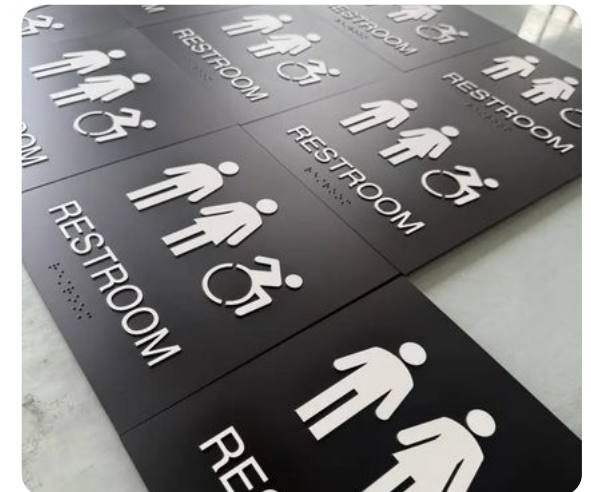
Facility direction plates