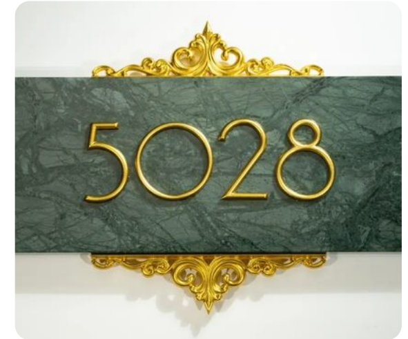
Green stone-style insert with raised number