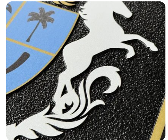
Crest-style carved sample detail