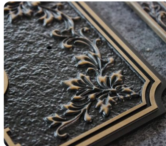
Relief border and texture detail