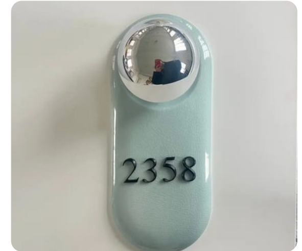
Ceramic and polished number detail