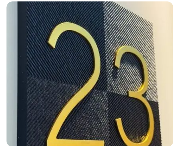
Raised metal number close-up