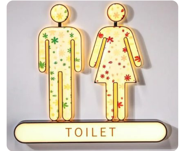
Illuminated restroom sign