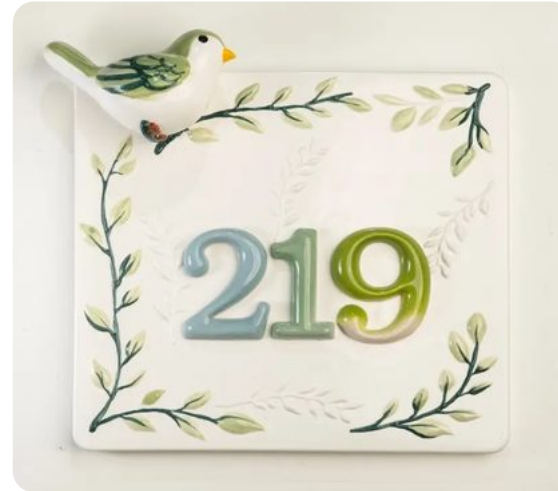
Decorative address plaque