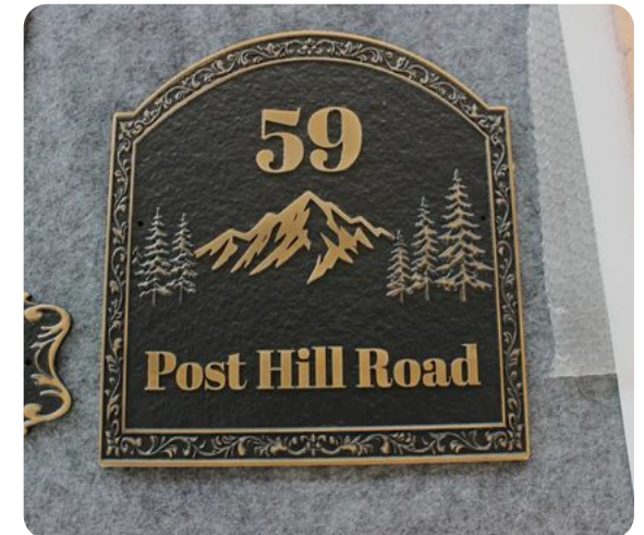
Arched villa entrance plaque