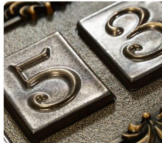
Raised number close-up