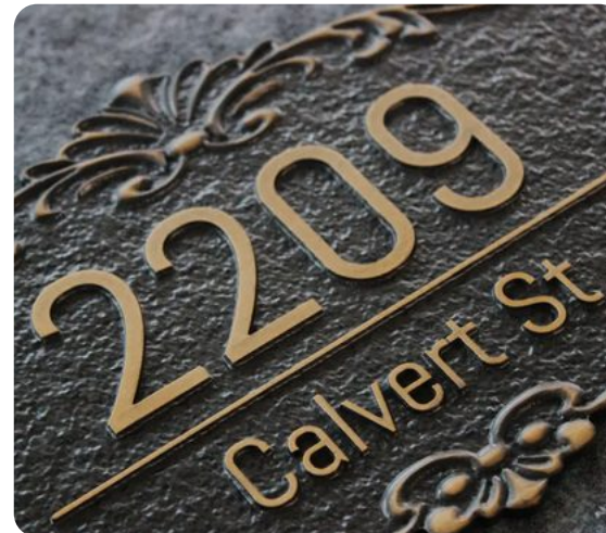
Antique raised lettering detail