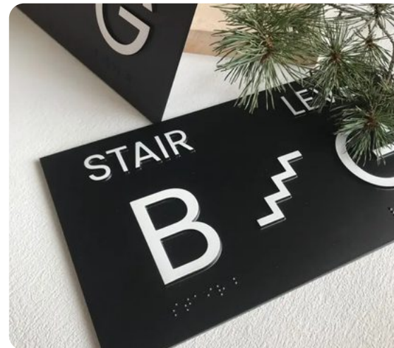
Stair and level guidance