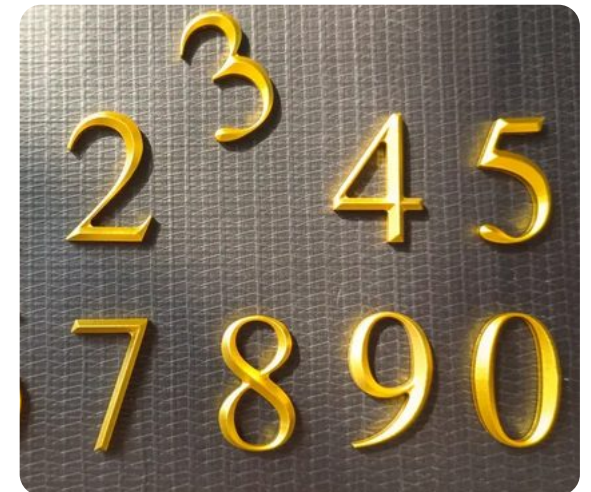
Gold modular number set