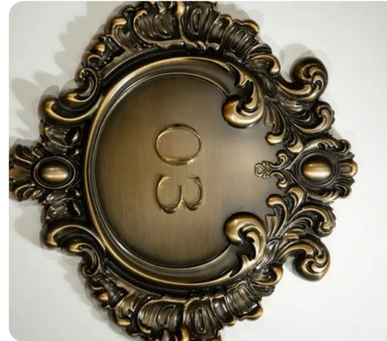
Ornate carved room plaque