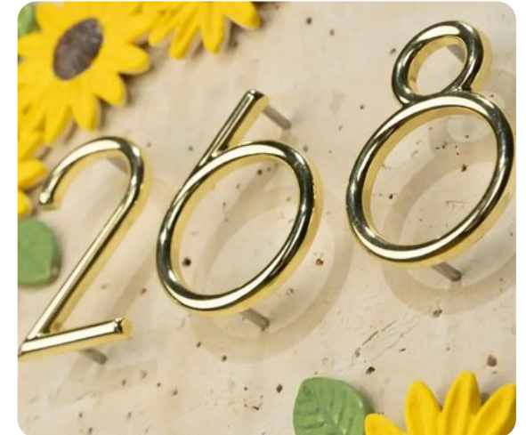
Polished number detail