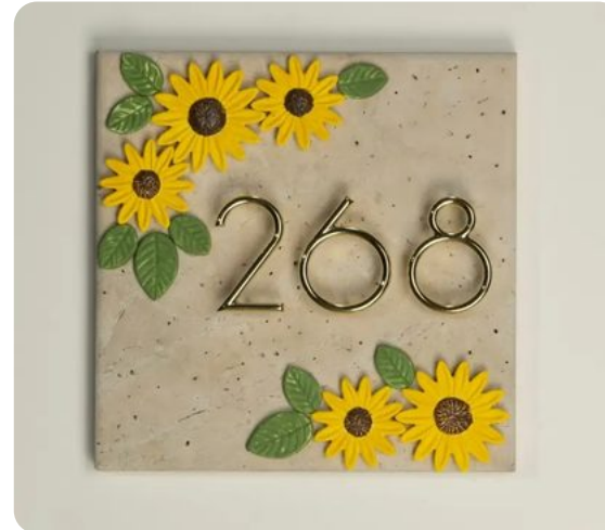
Custom decorative number plate

Product reference, size, thickness, quantity, numbering schedule, installation surface, finish target, and artwork files.