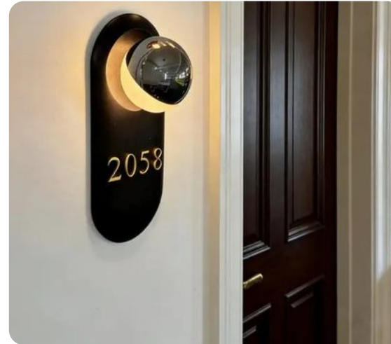
Illuminated room number module