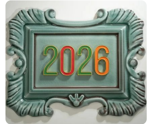
Colored exterior number plaque