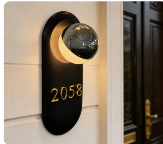
Wall-mounted boutique door sign