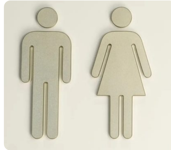
Minimal restroom icon set